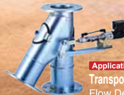
Application Example 3 Transport Path Changeover Valve Flow Detection (Confirmation of Mixing)