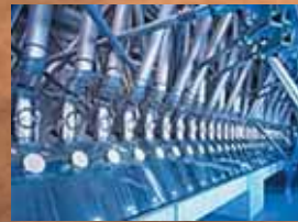
Application Example 4 Transport Path Flow Detection

MONITORING EXHAUSTED DUST AND THE DENSITY OF MINUTE PARTICLES AND DETECTING FLOW / NO FLOW !