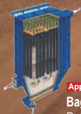
Application Example 2 Bag Filter, Exhaust Air Duct Detection of Exhausted Particles